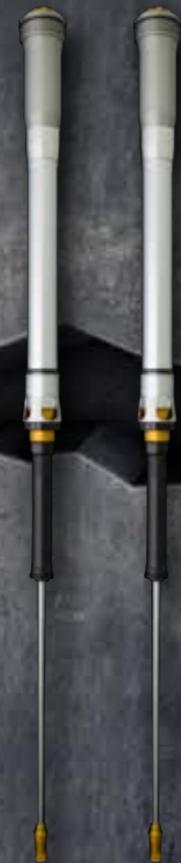
TTX 22 CARTRIDGE KIT