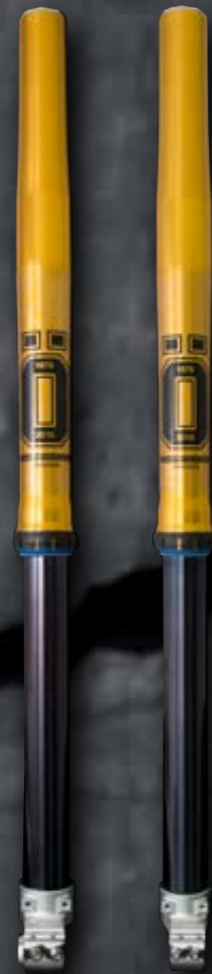
RXF 48 RACING FRONT FORK

Tailor made for you! We have the perfect part for your bike, delivering outstanding performance at a competitive price. Öhlins manufactures more than 300 different shock absorber models, every one uniquely fitted to your bike and suited to fit without interfering. We make sure that the product behaves the way it should, through the design of the shim stacks and valves as well as the calibration of the adjusters. This is no guesswork. We try the settings out, in real life, and adjust them until everything works perfect for each and every specific model. Then we assemble the products with utmost precision to ensure superior control of the damping force. That is the key to our success.