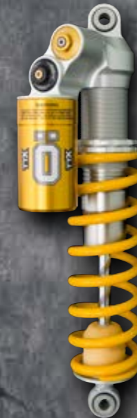
TTX 30 SHOCK ABSORBER