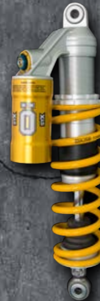
STX 46 SHOCK ABSORBER