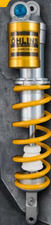
TTX FLOW SHOCK ABSORBER