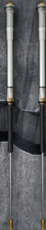
STX 22 CARTRIDGE KIT